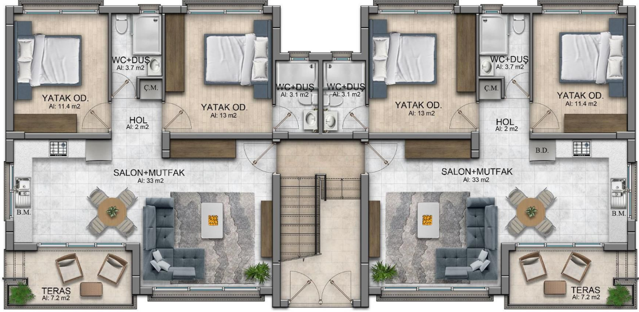
ZEMİN KAT PLANI A TİPİ