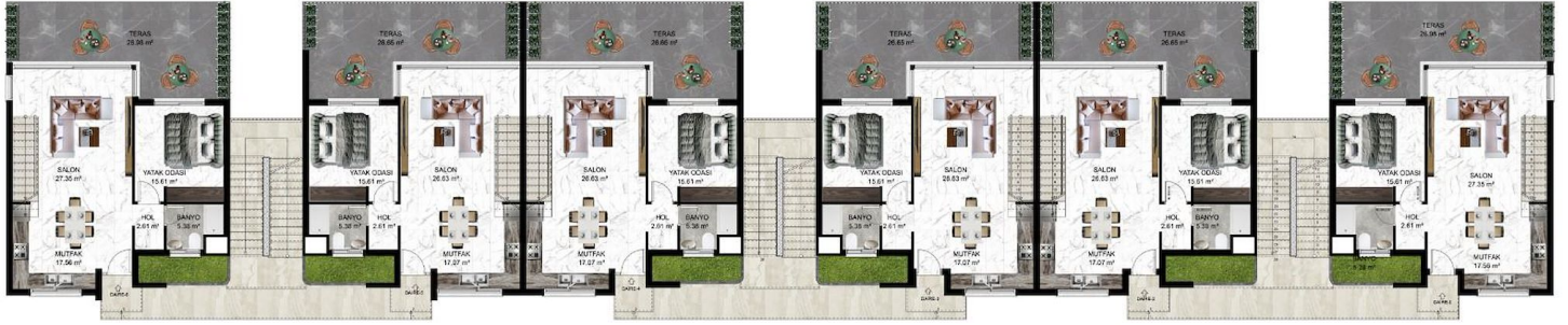
A BLOK ZEMİN KAT PLANI