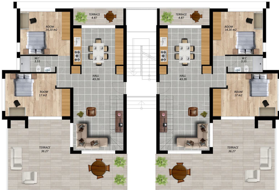
TYPE C FIRST FLOOR PLAN