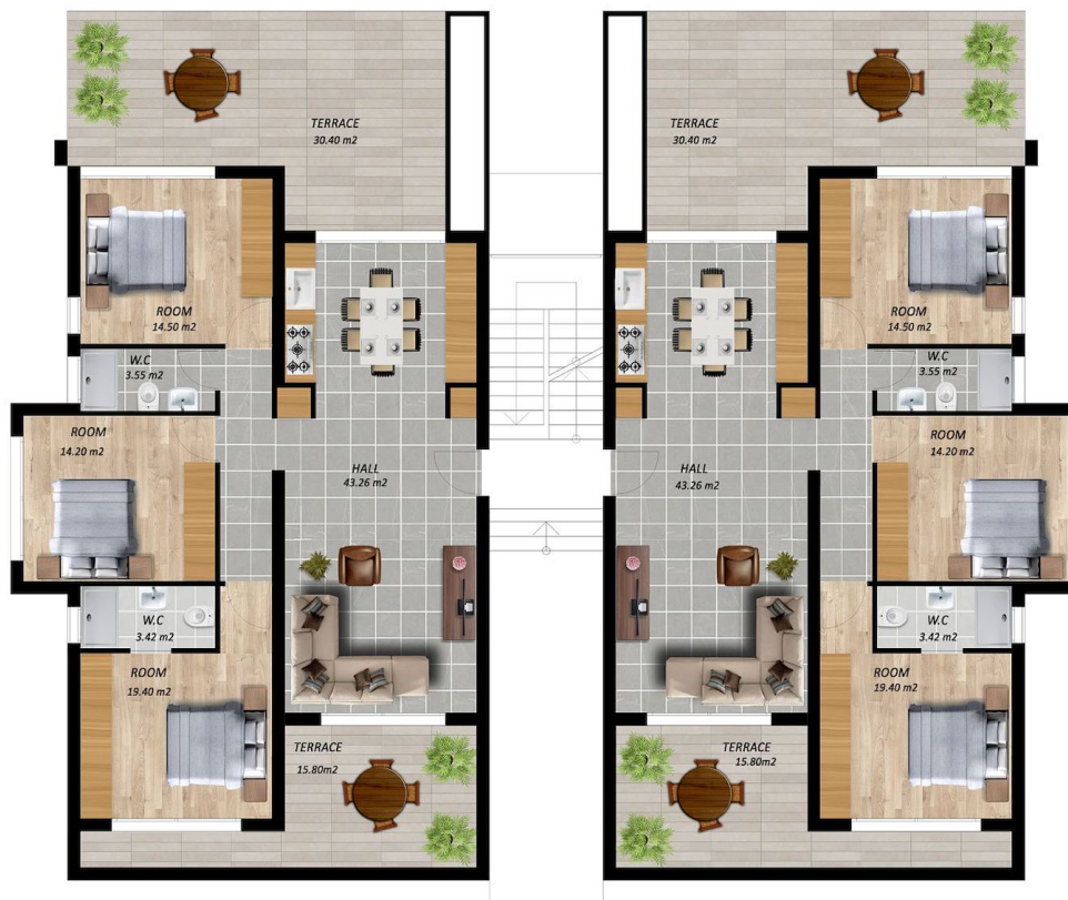
TYPE C GROUND FLOOR PLAN