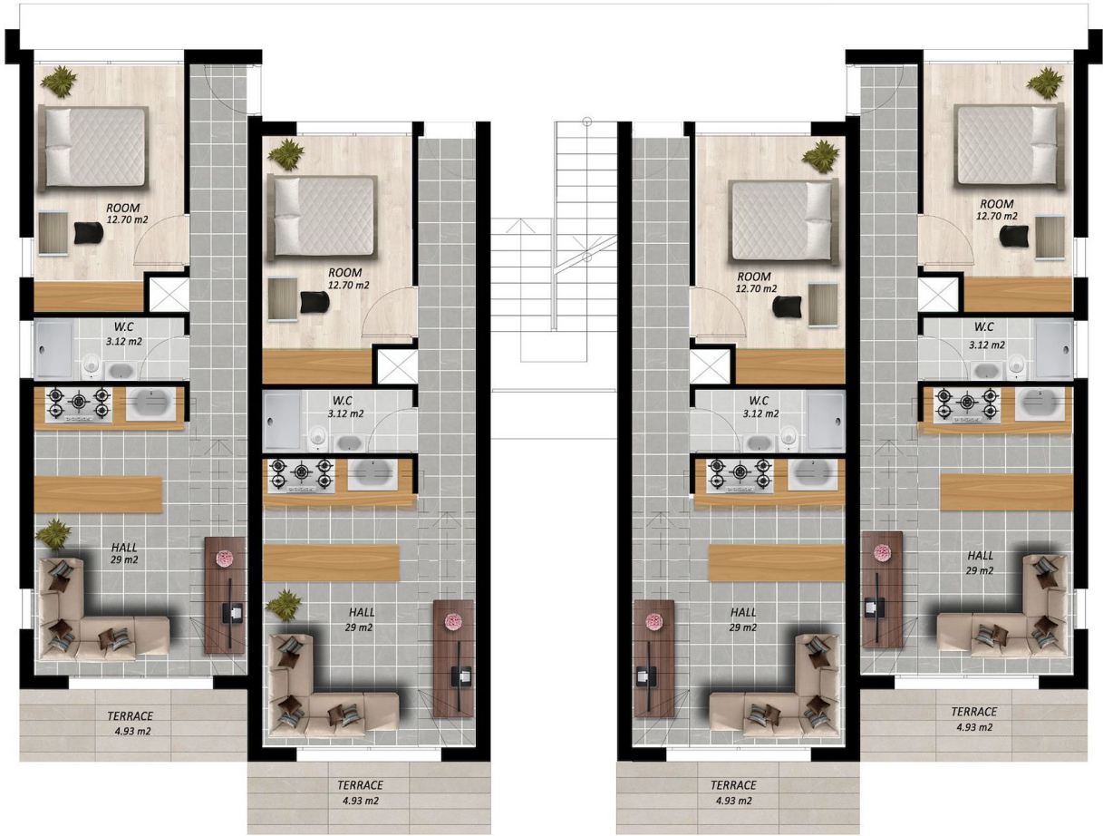
TYPE A FIRST FLOOR PLAN