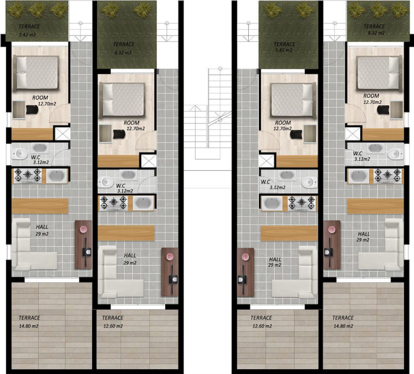
TYPE A GROUND FLOOR