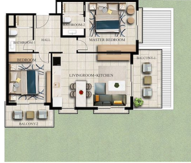
FIRST FLOOR x 2