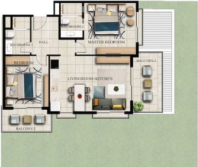
FIRST FLOOR x 2