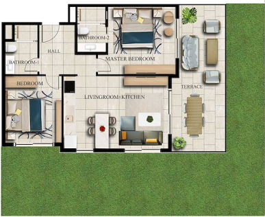
GARDEN FLOOR x 2