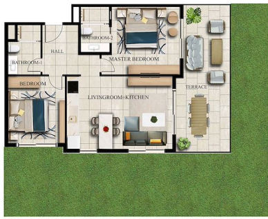
GARDEN FLOOR x 2