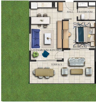
GARDEN FLOOR x 70