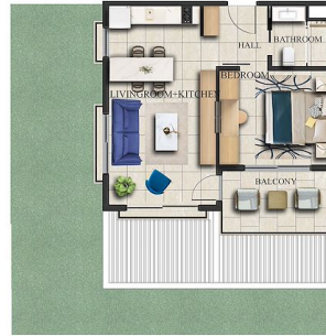
FIRST FLOOR x 70