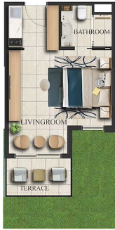
GARDEN FLOOR x 67