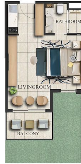
FIRST FLOOR x 67