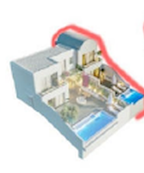
TYPE - B