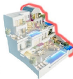
TYPE - A