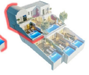
TYPE - E