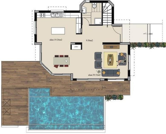
Zemin Kat Planı - Ground Floor Plan Alan - Area: 104 m2