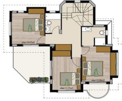
Birinci Kat Planı - First Floor Plan Alan - Area: 86,40 m2