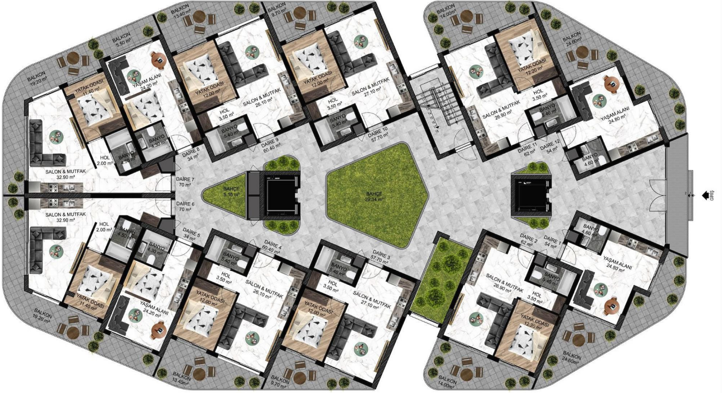
BLOK 6 ZEMİN KAT PLANI