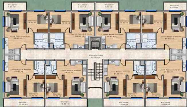
1+1 Apartments First Floor Plan