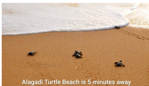
Alagadi Turtle Beach is 5 minutes away